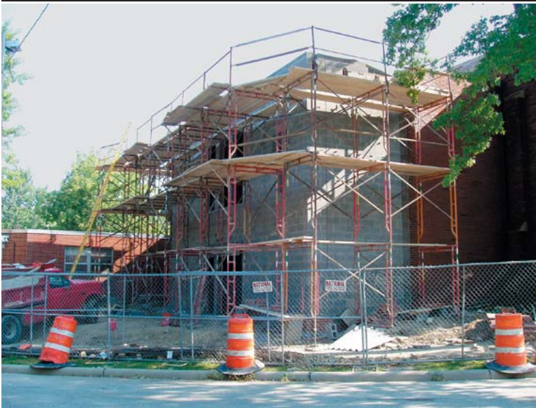
The block walls looked like this in late August. By the time this newsletter is out, the brick should be up and the scaffolding down.