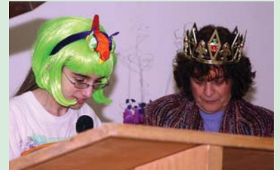
Megillah Reading on Purim