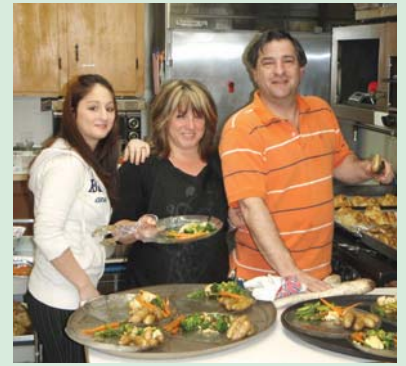
Our Cooks are Members