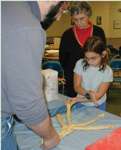
Challah Baking Class