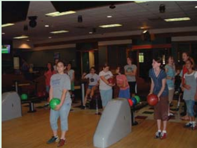
Youth Group Bowling Night